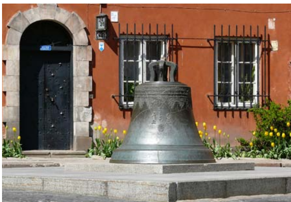
The bell at Kanonia

At Canon's House one may also find Warsaw's oldest stone tablet marking the name of the street itself: ulica Kanonia.