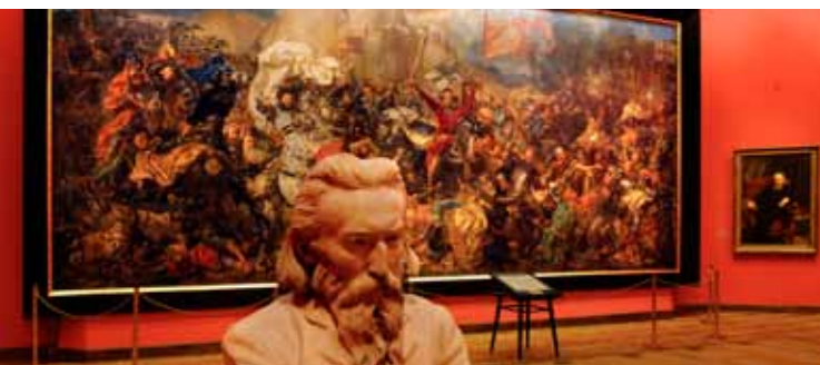
The National Museum, Al. Jerozolimskie 3 tel. 22 629 30 93, www.mnw.art.pl . On Saturdays admission free.

The National Museum in Warsaw is the largest art museum in Warsaw and one of the most important cultural institutions in the country. A large part of the collection is presented in the following permanent galleries: Ancient Art, Eastern-Catholic Art, Medieval Art, Polish Painting, European Painting, 20th century Polish Art and Decorative Arts. The collections include monuments of early Christian art, sculpture, panel painting and goldsmithery from all regions connected historically with Poland in the Middle Ages, as well as works of art from other important centres of Europe such as images, sculptures and handicrafts from the Middle Ages to the beginning of the 20th century. A huge painting by Jan Matejko (19th century), 'The Battle of Grunwald' is an undeniable attraction of the museum, with its imposing dimensions of 426 x 987 centimeters. There are a huge number of temporary exhibitions on display, which come from all over the world. The wing of the building from the side of the Vistula River is the Polish Army Museum which is the only museum in Poland depicting the history of the Polish Army from its beginnings in the 10th century to the end of World War II. In the courtyard in front of the museum you can see military equipment from the First and Second World Wars, including tanks and helicopters.