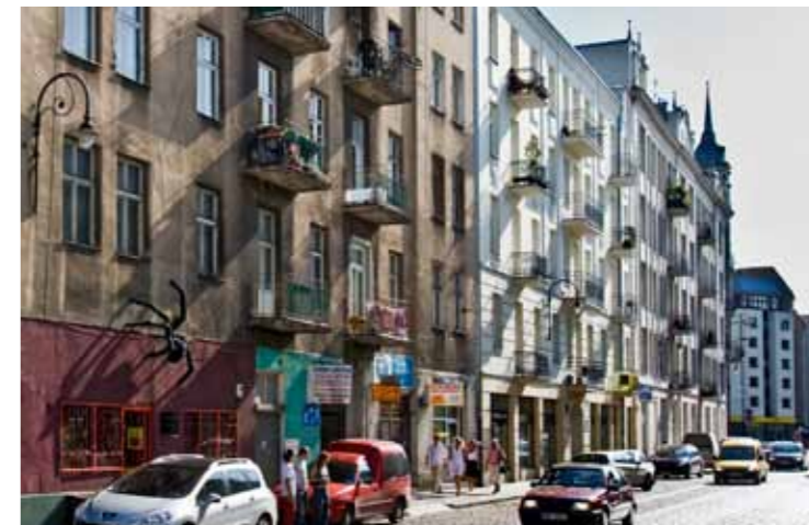
Praga District ul. Ząbkowska

Through the centuries, Warsaw's right-bank - the area called Praga - was an independent town, and it became formally attached to Warsaw only in the late 18th century, when it was considered a secondary part of the city. Owing to the fact that it emerged almost unscathed from WWII, today it is a fascinating district, overflowing with artistic studios, galleries, alternative theatres and underground clubs. Thanks to this infusion of cool culture, many of the surviving post-industrial buildings have been turned into cultural centres, cinemas, galleries and pubs. But it is also in Praga that we can find many streets which were undamaged during WWII, and so there are some beautiful pre-war lamp-posts, sidewalks and apartment blocks. One of the main streets of old Praga is Ząbkowska Street . For many people this area is 'Praga's Old Town'. It is here that can found one of Praga's most popular attractions: the old Koneser vodka factory. A complex of red brick buildings from the late 19th century, for over a hundred years, an alcohol factory was located on its premises. Koneser is now a modern cultural centre, with numerous cultural institutions and is one of the city's most important examples of post-industrial architecture.