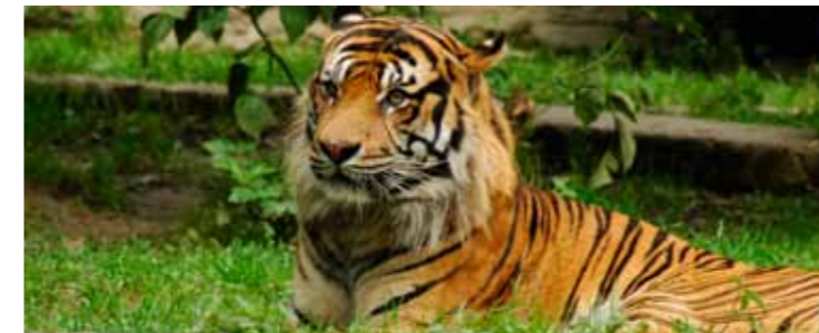
Zoo ul. Ratuszowa 1/3, tel. 22 619 40 41, www.zoo.waw.pl

At the centre of the Zoo is the special 'Fairytale Zoo' (Baśniowe Zoo), where children can stroke the animals and feed them carrots and apples; there is also a large, modern, safe playground.