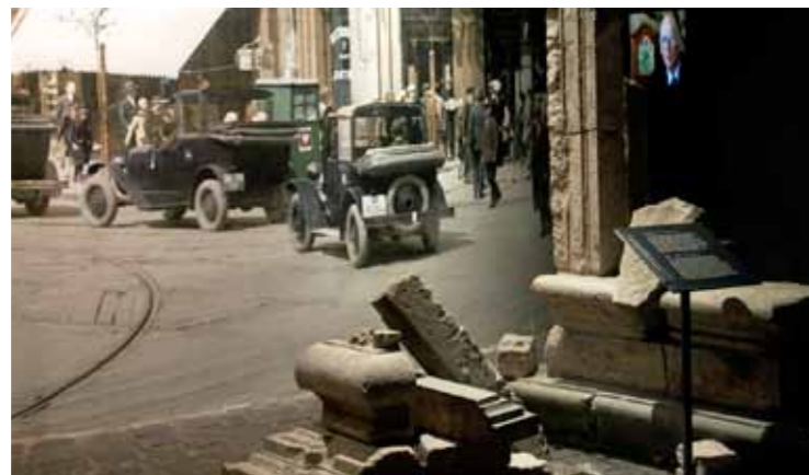
The Warsaw Rising Museum, ul. Grzybowska 79 tel. 22 539 79 05, www.1944.pl . On Sundays admission free.

The Warsaw Rising Museum opened on the 60th anniversary of the Warsaw Uprising, and is one of the most interesting and most-visited museums in the capital. It's housed in a former tram powering station at 79 Grzybowska Street. In addition to the main building, there is also Freedom Park and Memorial Wall and Bunker. Until the recent opening of the Chopin Museum, the Rising Museum was the most modern and newest museum in Warsaw. Its exhibitions show not only the city's heroic struggle, but also the daily life of the insurgents. One of the Museum's many attractions is a replica of a bomber, the B-24J Liberator. The Museum also offers a wide variety of educational and cultural activities: it organizes classes and workshops for young people, it creates numerous very interesting educational games, and also schedules lectures, films, concerts and theatre performances. The most important events take place during the week of August 1st, to commemorate the outbreak and duration of the Uprising.