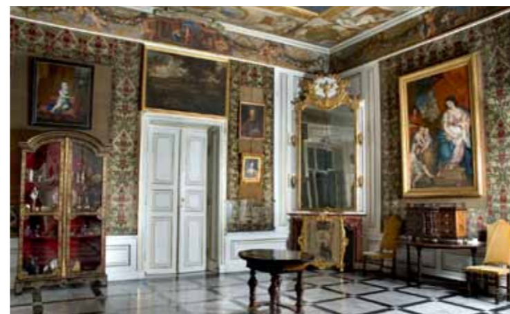
Wilanów Palace and Garden Complex ul. St. K. Potockiego 10/16, tel. 22 842 07 95, www.wilanow-palac.art.pl

Wilanów Palace was once the royal summer residence of King Jan III Sobieski and King August II, as well as many distinguished and noble families. The name of the residence and the whole area comes from the definition of 'Villa Nova'; it was Sobieski who gave this name to the lands when he purchased them in the 17th century. The impressive Palace combines the elements of a noble mansion, an Italian villa garden and a palace in the style of Louis XIV, the French 'Sun King'. The Palace is one of the most beautiful examples of European Baroque architecture and splendor, and is a testament to the Republic of Poland. It is worth mentioning that in 1805, Stanisław Potocki (former owner of Wilanów in the 19th century) assembled his art collection in the palace, thereby creating one of the first museums in Poland. Between the palace and Wilanowski Lake, there is a two-level Baroque Italian garden, with a romantic English style park in its southern area. The palace and park are an important place of cultural events and concerts, and in the place of the former riding school, there is the Poster Museum.