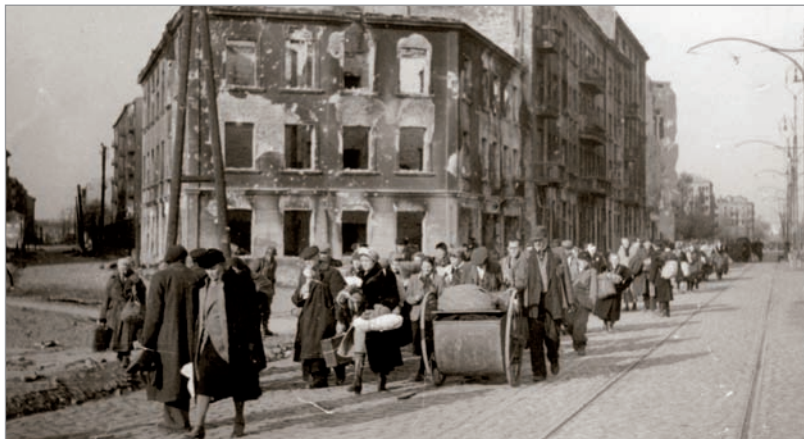
Grójecka Street. Capitulation. The civilians leave the city.

The Polish capital city was devastated in nearly 85% and its residents were taken to transition and POW's camps.