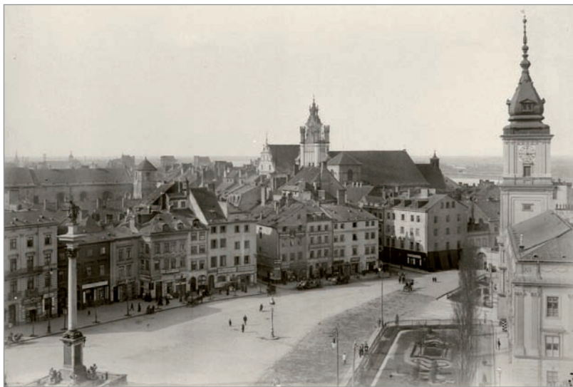
Zamkowy Square

The looming destiny of Warsaw, known as the 'Paris of the East' before the war, was fulfilled by Heinrich Himmler's order saying: 'Every citizen is to be killed. No prisoners are to be taken. Warsaw has to be razed to the ground. Let it be a horrifying example for the whole Europe.'