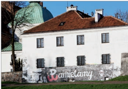
Mural. Church of the Visitation of the Virgin Mary at the New Town. (Archive of Warsaw Tourist Office)

Murals – contemporary artists pay tribute to the Insurgents also by means of modern art. Thus, it is worth visiting the Rose Garden in the Museum of Warsaw Uprising. It exhibits the works of Wilhelm Sasnal, Henryk Chmielewski better known as Papcio Chmiel and others. Further works were painted on a wall of the presbytery of the Church of the Visitation of the Most Blessed Virgin Mary in New Town, wall of the 'Polonia' sport club stadium at Konkwitorska Street and in other locations.