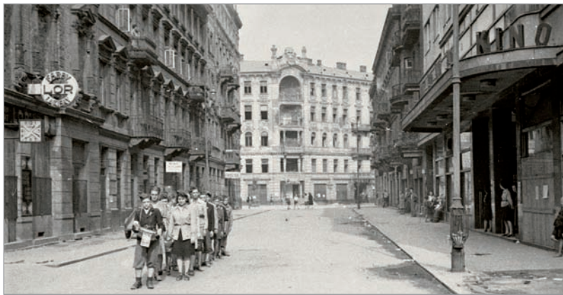
Scouts at Złota Street. In the background, buildings at Zgoda Street. Entry to the 'Palladium' cinema on the right side.

Palladium ul. Złota 7/9 – opened in 1937, the cinema survived the war and served its functions until 2000. During the occupation, the Germans changed its name to 'Helgoland'. Having seized the building, the Insurgents played their chronicles called 'Warsaw is Fighting'. Today, it is a music club and a theatre.