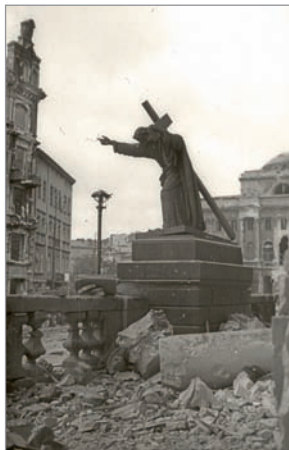
Krakowskie Przedmieście Street. The figure of Christ and remains of columns lying next to the pedestal.

King Sigismund III Vasa Kolumna (Kolumna Zygmunta III Wazy) plac Zamkowy – the oldest and the highest secular monument raised in 1644 from the initiative of Władisław IV in honour of his father, Sigismund III Vasa, who transferred the capital of Poland from Cracow to Warsaw. Three hundred years later, the monument was destroyed into pieces during the German attack on the Old Town. The first trunk of the column from the 17th century and the one destroyed during the Uprising are located now next to the Royal Castle.