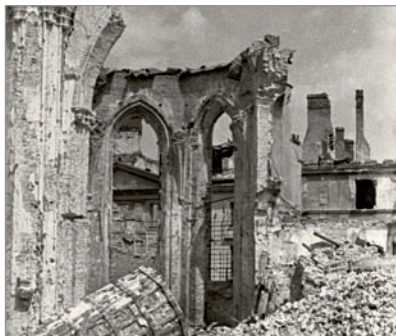
Ruins of St. John Cathedral – remains of chancel. View from Świętojańska Street. In the background tenement of houses at Kanonia Street.

Cathedral Basilica of Martydrom of St. John the Baptist (Bazylika Archikatedralna pw. św. Jana Chrzyciela) ul. Świętojańska 8 – fierce fights for the cathedral took place August 21-27. A bomb raid and a mass attack of the German infantry completely destroyed the church. It is said that a fragment of a caterpillar track from the so-called 'goliath' (light, caterpillar explosive carrier) was embedded in the Cathedral wall from the side of Dziekania Street. However, it is not true. Most probably, the track is a part of the tank-trap that exploded at 1 Kilińskiego Street.