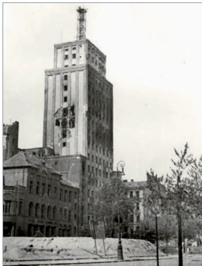
'Prudential' bulding at 9 Napoleona Square.