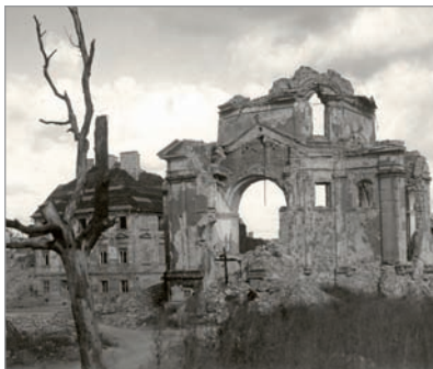
The ruins of Warsaw, 1945. New Town Market Square. Ruins of the Church of St. Casimir.