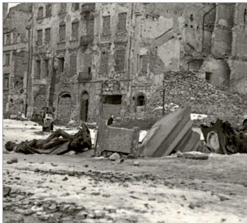
Shattered column and statue of King Sigismund's lying on the pavement at Zamkowy Square. In the background – destroyed houses of western frontage of the square.