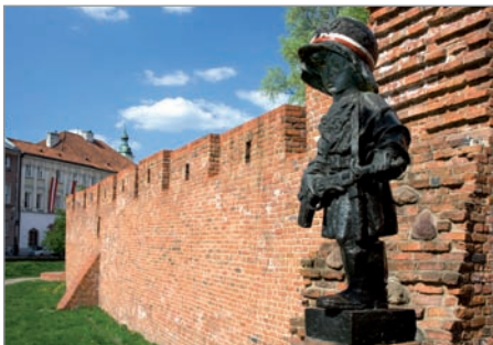
Little Insurgent Monument.