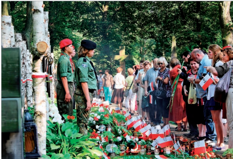
Powązki Military Cemetery. Celebrations of August 1.

August 1 – every year Warsaw pays tribute to the Insurgents. The national flags are hung on the street of Warsaw and candles are lit in places sacred with the blood of the murdered residents of the city. In the Powązki Military Cemetery, under the Gloria Victis monument, the representatives of the highest state authorities, combatants and residents of the capital lay flowers. At 5:00 PM, for one minute the whole traffic freezes and the sirens are sounded. On Piłsudskiego Square, the residents of Warsaw sing insurgent songs.