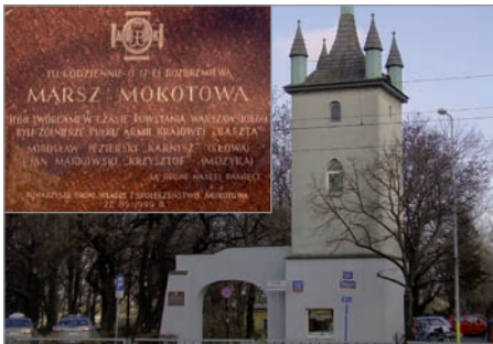
The clock tower of a Gothic house at 59 Puławska Street.