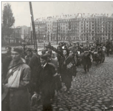
Units of Insurgents going into captivity. Grójecka Street.

September 2 – in the night of September 1, tank shells destroy King Sigismund's Column. The Old Town is seized by the Nazis. The fight in other Warsaw districts continues.