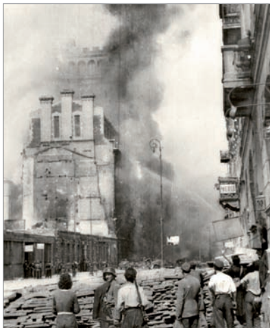
Burning building of Polish Telephone Joint-Stock Company at 37/39 Zielna Street.